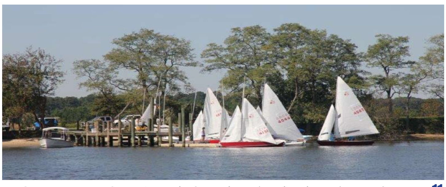
Comets return to Corsica's new facilities after a day of perfect sailing conditions.